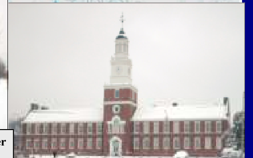
The "A" Building