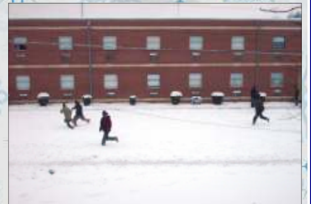
Students playing in the snow outside E.L. Rust Hall