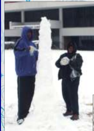
Building on a snow monument...

The Holly Springs/Rust College community awakened Monday, February 8 to a city and campus blanketed in snow.