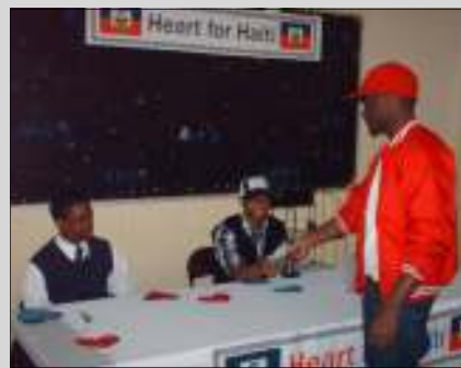
Members of the freshmen class are selling “Hearts for Haiti”. The money raised will be sent to Haiti to help in the earthquake relief efforts.

Friday, February 12 will mark one month since the deadly quake struck the small country. Rescuers are still searching for and recovering victims, removing debris, and bringing supplies to survivors.