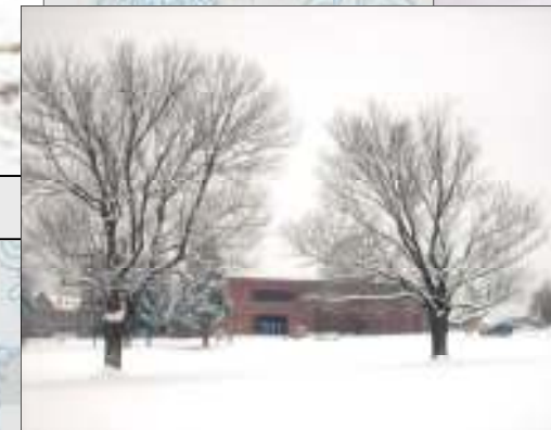
Through the trees... The Doxey Fine Arts Center